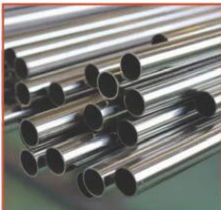
PIPES / TUBES